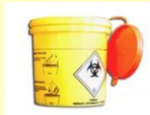
1 Waist container