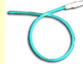
1 Aspiration catheters suction tubes