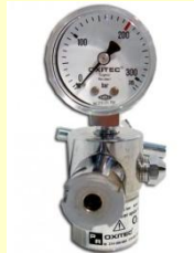
1 Oxygen bottle (7lts empty) flow meter and regulator