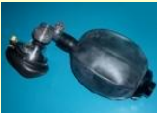
1 Adult, pediatric and neonatal manual resuscitator with mask