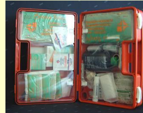
1 First Aid Box