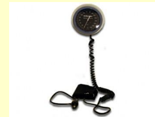
1 Sphygmomanometer professional aneroid